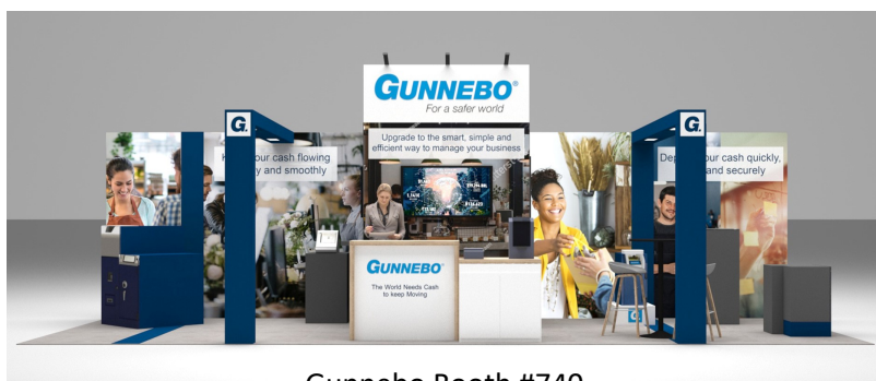
Gunnebo Booth #740

most complete marketplace to learn rich retail content , explore innovative retail technologies , and learn about groundbreaking solutions to transform one's business.